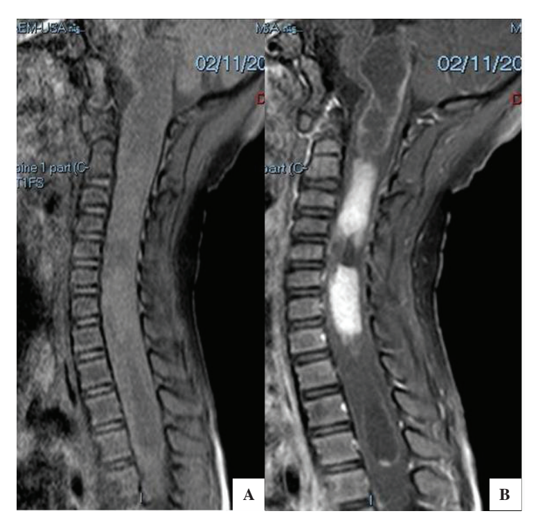
Figure 1. MRI showed a mixed solid-cystic intramedullary lesion involving the medulla, entire cervical to T4 spinal cord associated with cord expansion. The solid portion was at the C2-T1 cord level. There were peripheral enhancing cystic portions and syringomyelia associated with the tumor mass.

improvement of motor power which is grade 4+ in the left extremities.