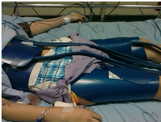
Figure 2. A patient is undergoing targeted temperature management (TTM) with cold water pads.

Indwelling venous catheter with extracorporeal cooling machine is the most common technique for endovascular method. The catheter may be inserted via femoral, subclavian or jugular vein. The machine also comes with the auto-feedback temperature regulation system. Two brands are available in worldwide market including CoolGard 3000® and Celcius Control System®. Achievement of rapid temperature lowering to the target, tightly maintained target temperature and actively controlled rewarming with endovascular methods have been reported in the literature. 37,38 Shivering control with skin counter-warming can easily be applied to the patients undergoing endovascular